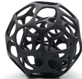
Picture taken after dye post-processing