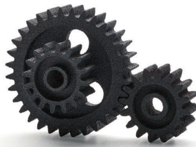
Picture taken after dye post-processing